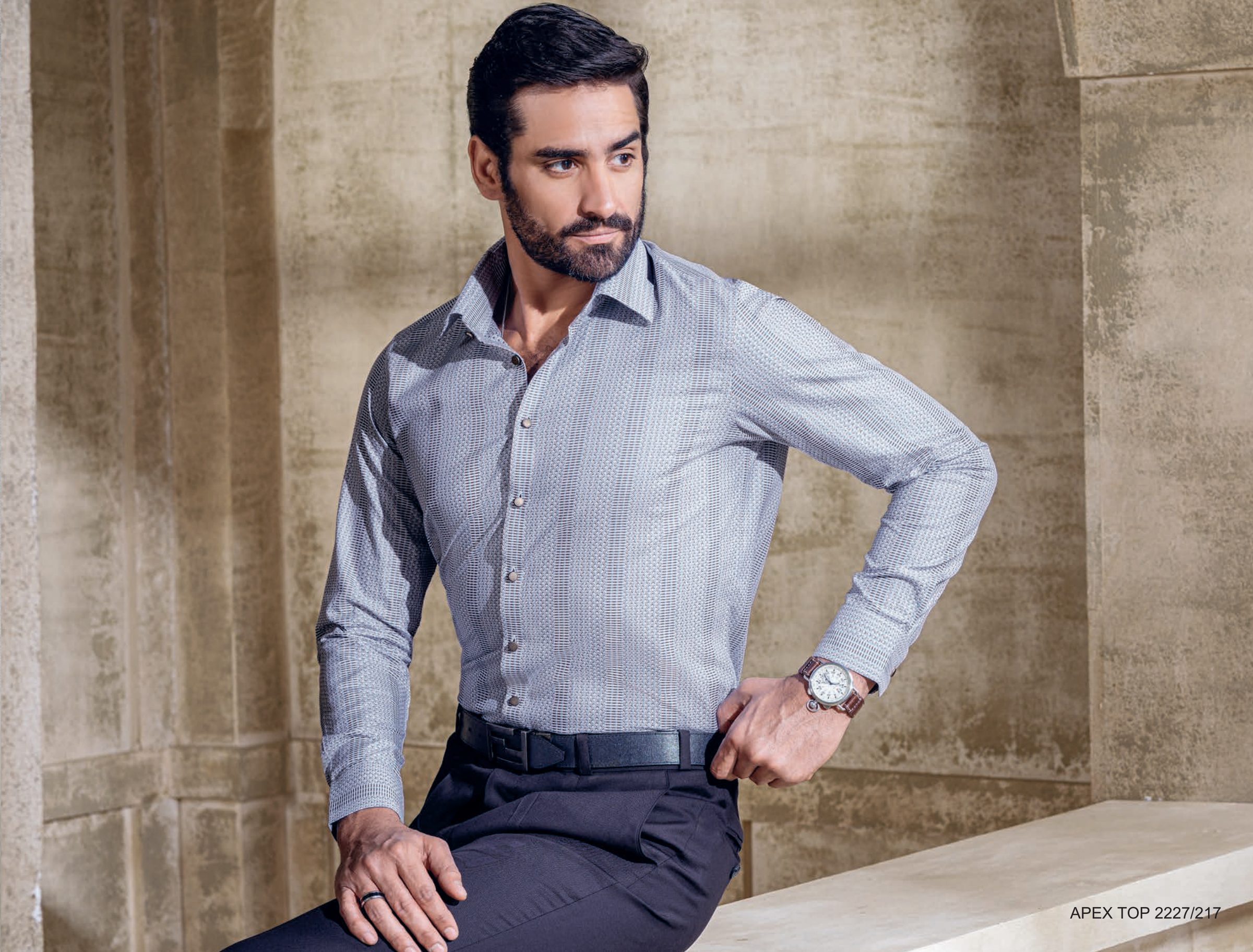
APEX TOP 2227/217