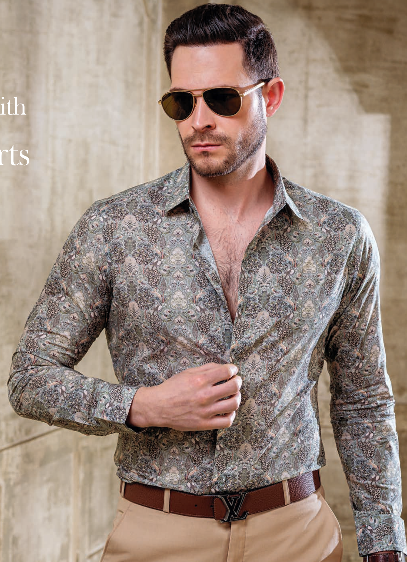
TOLOSA PRINT 2228/663