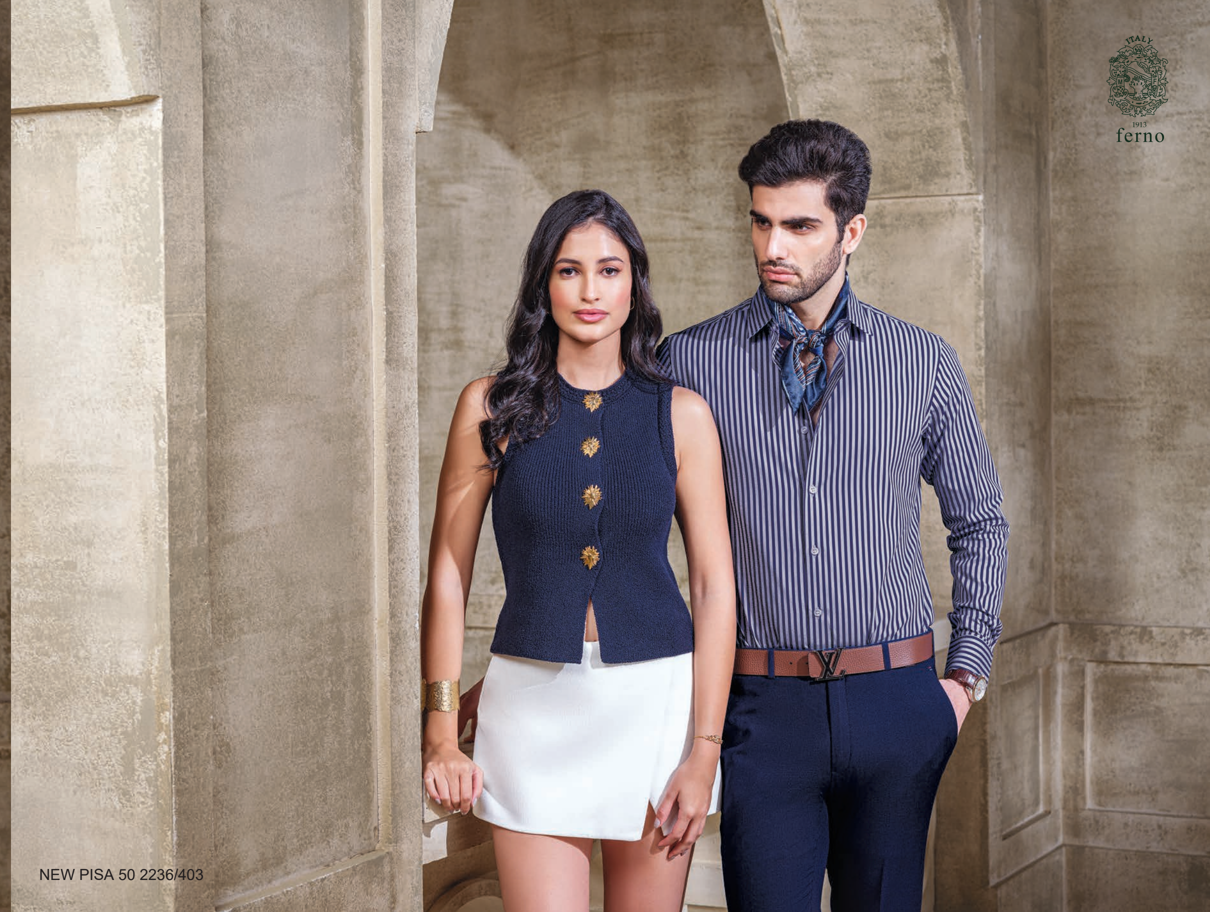
NEW PISA 50 2236/403