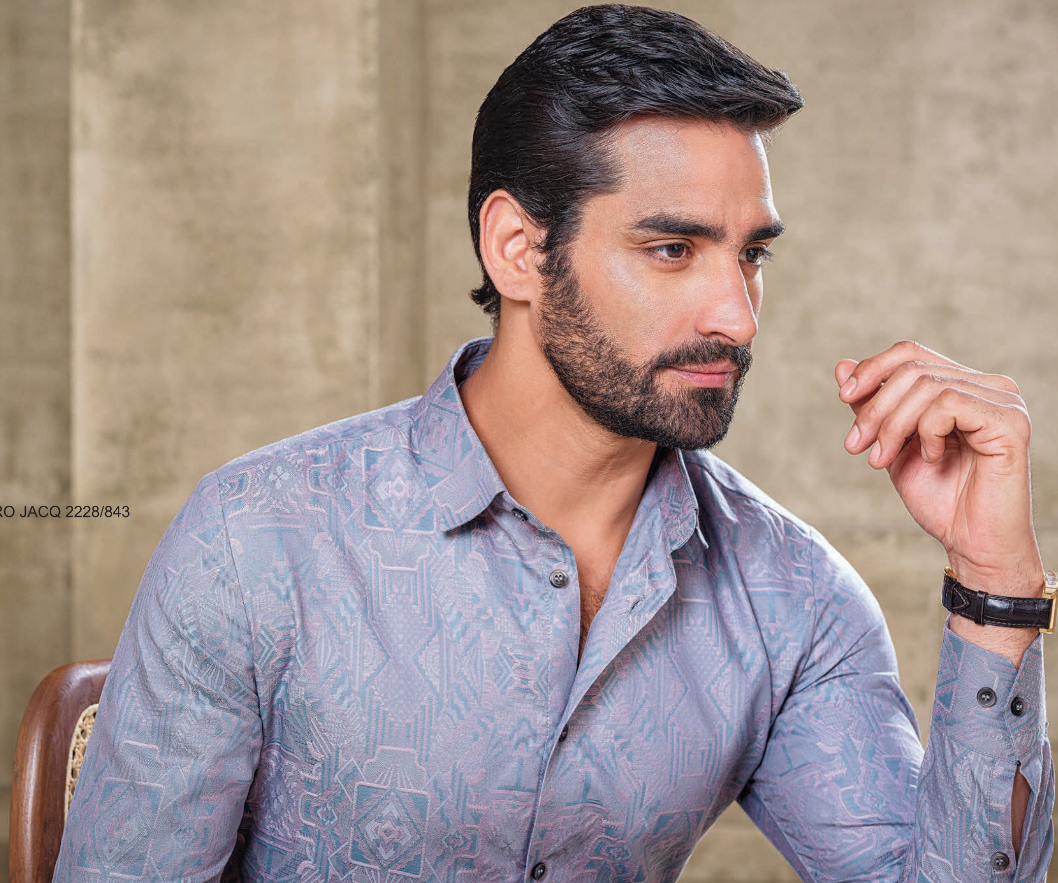
LEBERRO JACQ 2228/843